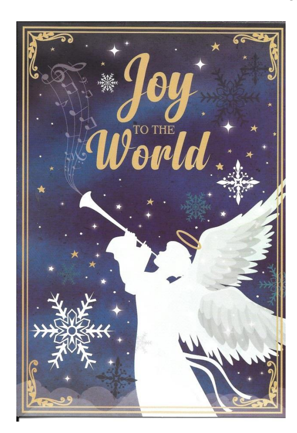
Rejoice in the miracle of Christmas And take comfort in His Peace and Grace Wishing you a blessed Christmas and a New Year full of PROMISE