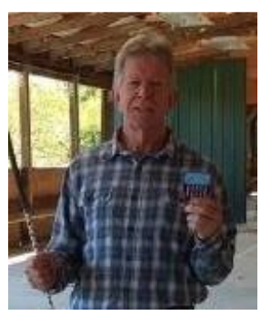
Merle South League High Avg 51.56%